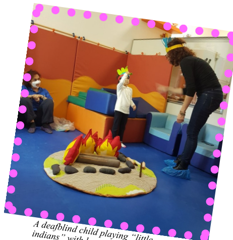
A deafblind child playing "little indians" with her mother

Once parents are back home they can share their experience and the suggestions we have given them to therapists and educational personnel