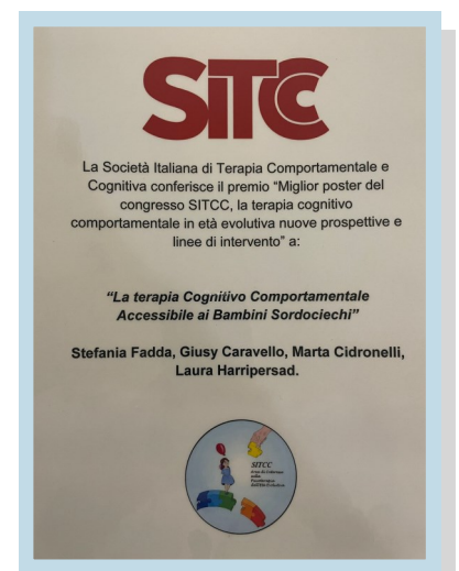
The award "best poster" given to CABSS

SITCC is a non-profit scientific-professional society, whose purpose is to deepen the theoretical, methodological and clinical aspects of the cognitive behavioral approach to psychological, psychiatric and social problems.