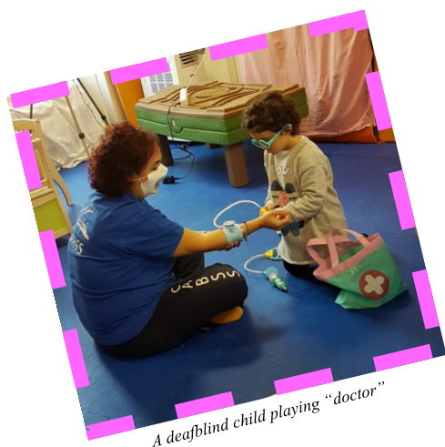
A deafblind child playing "doctor"

The Assistance Center for Deaf and Deafblind Children- CABSS opens the doors of its multisensory laboratory to all deaf and deafblind children, even those who live outside of Rome. In fact, we host families from all over Italy, and even from abroad, thanks to the creation of intensive programs that allow them to come to our Rome headquarters and spend a week with us.