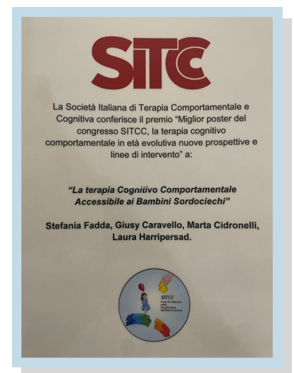
The award "best poster" given to CABSS

SITCC is a non-profit scientific-professional society, whose purpose is to deepen the theoretical, methodological and clinical aspects of the cognitive behavioral approach to psychological, psychiatric and social problems.