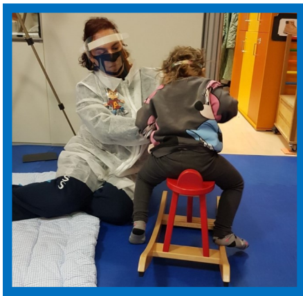
A moment during a therapeutic session at CABSS

The multisensory early intervention programs dedicated to deaf and deafblind children and their families represent the heart of CABSS's mission, which aims to offer these children the tools they need to express their full potential and be supported by parents who are aware of their specialized needs.