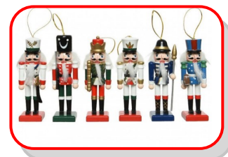
Photos of the CABSS' Christmas decorations