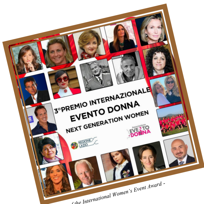
The poster of the International Women's Event Award - third edition