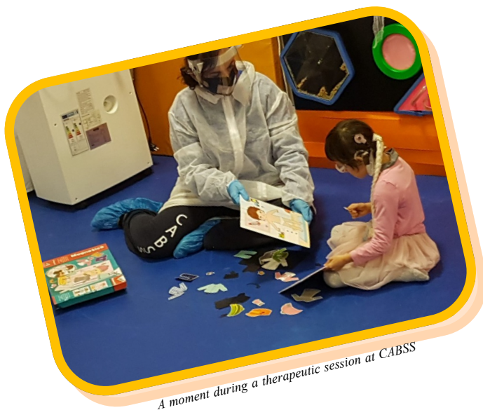
A moment during a therapeutic session at CABSS