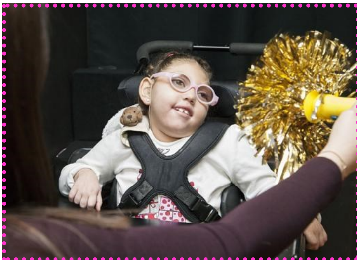
A little girl with CVI Picture from the Perkins School for the Blind

Source: https://nei.nih.gov/faqs/cortical-visual-impairment-cvi