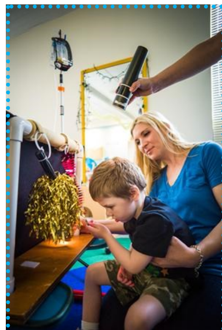
A little boy with CVI

CVI can be difficult to diagnose due to the lack of ocular irregularities and high rate of additional disabilities. The diagnosis of CVI occurs through medical examination and neuroimaging. The early diagnosis of CVI is essential to early interventions.