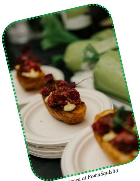
A dish enjoyed at RomaSquisita