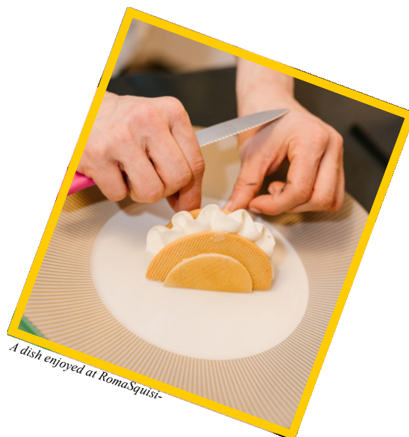
A dish enjoyed at RomaSquisita-