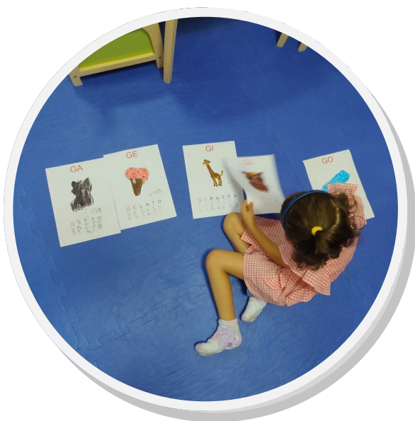
A student at CABSS working on syllables

At CABSS we believe that literacy plays a crucial part in the early years in the life of a child with deafblindness. The first thing we do at CABSS when we see the child is ready to address his/her literacy needs is complete our assessment and compile a literacy learner profile which gathers information about our student's sensory access, preferences and learning style and communication abilities. When the profile is completed, we then complete the literacy skills checklist which helps us to identify where the child is on the literacy continuum. Thanks to the Literacy Skills Checklist we are able to understand at what level our student is in his/her literacy development (Deafblind National Literacy Work Group, 2014).