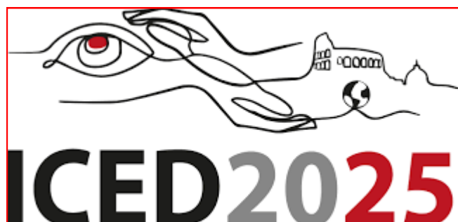
The ICED 2025 logo