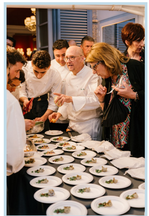
Chef Heinz Beck